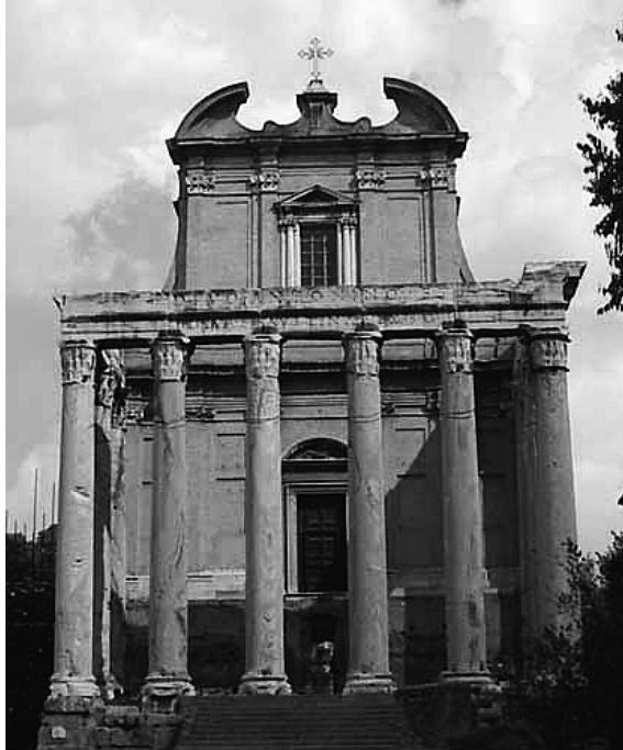
22. Temple of Antoninus and Faustina in the Forum Romanum, converted into the church of Saint Laurence in Miranda.

could present the Christian iconography in relation to its so-called pagan predecessors. We could show how there has not only been a use of columns and capitals of Roman temples in the Christian churches (fig. 22), but a reutilization of all the iconographic themes of the cult of Divus Iulius and Divi Filius .