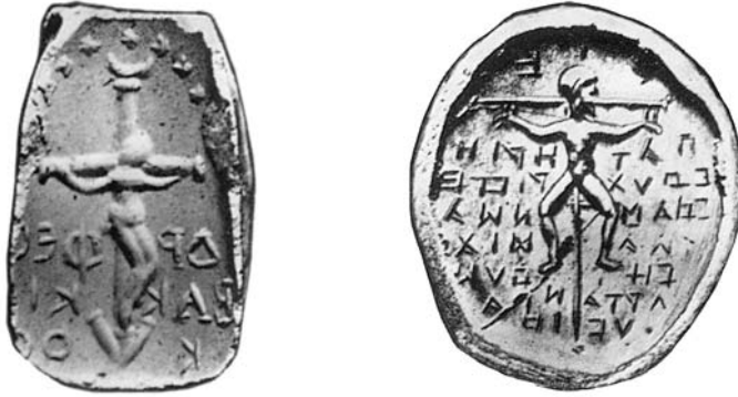
20. Orpheos Bakkikos, signet stone, IIIrd cent.; 21. Crucified one, gem, IIIrd cent.

ferred'; and the crucifixion and Pontius Pilate do not appear until the Constantinopolitan Council. 14 The Gospel of Peter, middle of the 2nd century, speaks, yes, of crucifixion, 'but he remained silent, as if he did not suffer pain'. 15 The Koran has retained the memory of those Christian diatribes when it says: '... they did not crucify him, but it only appeared to them ...'. 16 And we can ask ourselves whether the rejection of the crucified one—and strangely not of the cross—which endures to this day, is not the continuation of that old disagreement.