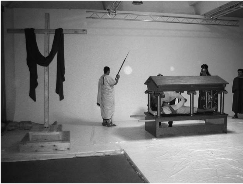
7.-11. Reconstruction of the funeral of Caesar.