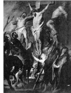
17. San Damiano, XIIth cent.; 18. Giotto, 1305; 19. Rubens, 1620

The Christ on the cross does not begin to hang until the Renaissance, and at once hangs more and more—despite the fact that in antiquity they knew how to represent really crucified ones, whom they let hang, as we can see on this orphic signet stone and gems from the IIIrd cent. (see fig. 20-21, next page).