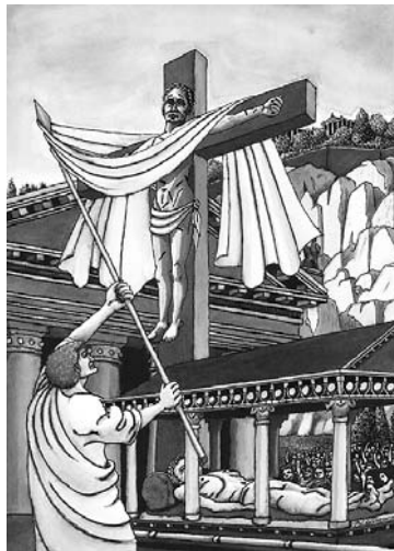
6. Sketch for a reconstruction of Caesar's funeral – Pol du Closeau

Graphic reconstruction of what one could see on the Forum: 11