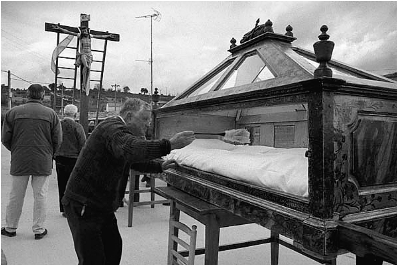
12. Good Friday in Bercianos de Aliste – © Photography by Xavier Ferrer Chust