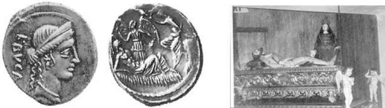
1.a Ov : Venus Genetrix; Rv : Cremation of Caesar; 1.b Figures of Good Friday

As far as the crucifixion is concerned, it is ignored, but the first one occurred with Caesar himself. At his funeral his body lay in a shrine made after the model of the temple of Venus Genetrix, placed on the rostra, with a tropaemum at its head, on which hung his blood-stained robe; the consul Antony lifted it with his lance making it flutter; and a wax effigy of his martyred body was hoisted above the bier and shown to the people who, seeing the wounds, revolted against the murderers. 9 This was considered his posthumous victory, his resurrection, if we judge by the coin minted to celebrate the event: 10