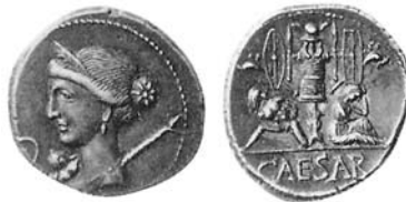
3. Denarius of Caesar, 46 B.C.

(Note on the obverse Venus Genetrix, the divine ancestral mother of the Julians, with her son Amor on her shoulder, or, in his place, the number LII (52): the age of Caesar, who is presented as her son).