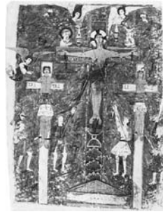
14. Carolingian, IXth cent.; 15. Xth cent.; 16. miniature, 975 A.D.