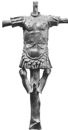
4. Miniature Tropaeum (Berlin Charlottenburg)