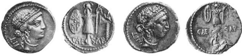
2.a, 2.b Denarii of Caesar, 48 B.C.