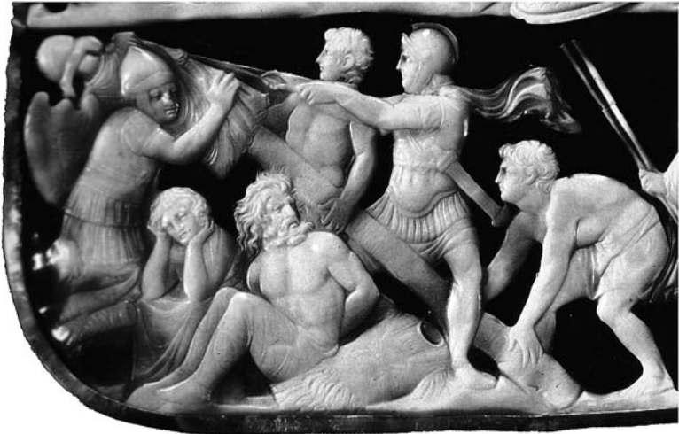
5. Cameo (detail) – Augustean age

How a tropaeum was hoisted can be observed on a cameo: